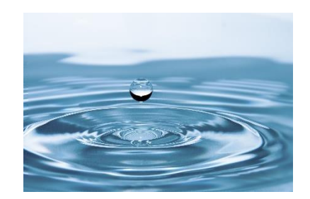
President's Message Week of June 3, 2019 – Clean Water Week