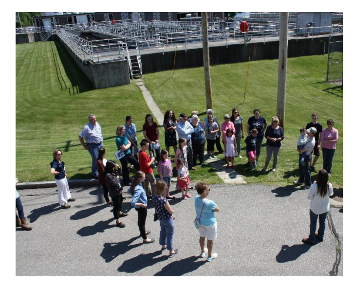
Gathering before taking the 82 steps to the top of the "bio tower" and aeration basins