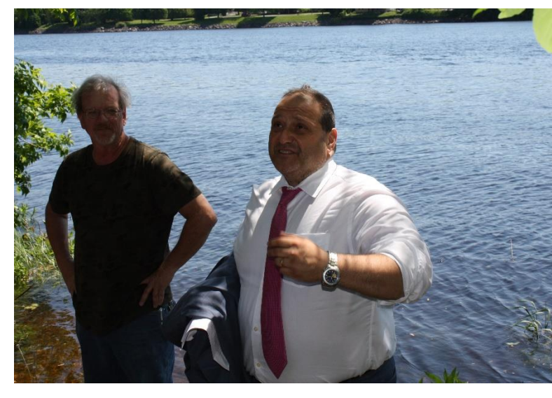
Mayor Joe Baldacci thanking the Bangor WWTP staff for all their work, congratulating the winning students, and welcoming us to Bangor.