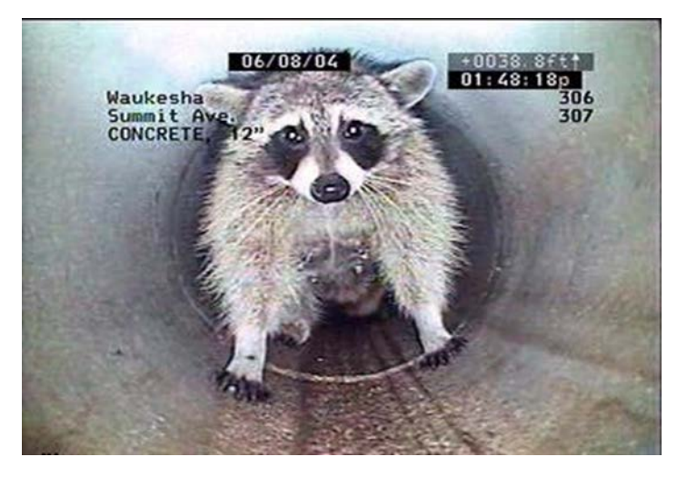
Is it spring yet?

The April <u>Maine DEP O&M News</u> is out and has some great information including upcoming training opportunities from MRWA, MEWEA, NEIWPCC, JETCC, and NEWEA. Information is provided regarding the Coastal Communities Grant Program and NetDMR update. Additionally there is an enforcement update that details the Maine DEP approach as well as summary of cases that were resolved recently.