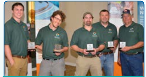
Force Maine placed second at the regional Operators Challenge.