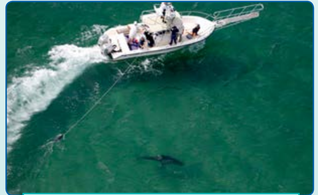
Tracking white sharks.

Maine Water Environment NEWS is a quarterly publication of the Maine Water Environment Association. (Publication months: Feb, May, Aug, Nov) Comments on the content in this publication should be addressed to: MEWEA, 60 Community Drive, Augusta, ME 04330.