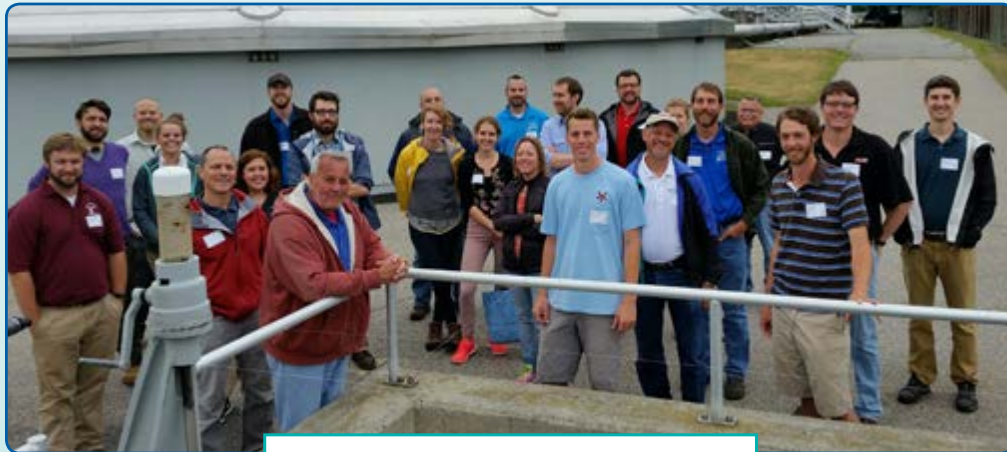
Group tour at South Portland’s WRRF

Always contact your local Industrial Pretreatment Coordinator from the municipality accepting the discharge and remember there are always consultants that can offer suggestions and assistance.