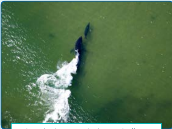
White shark peruses harbor seal off Cape Cod.

Those who want more information on this subject, or want to support the work of the Conservancy are encouraged to download the Sharktivity App or go to www.atlanticwhiteshark.org .