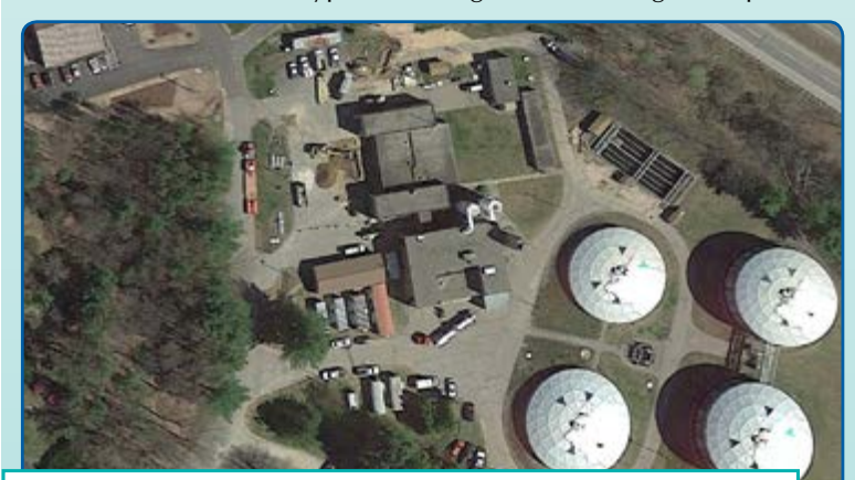
Aerial view of the Brunswick wastewater treatment facility.