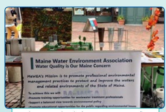
Booth set up with imhof cones comparing influent waste water treated effluent and tap water.

Here's are some things we've been up to this year: Portland Greenfest (eco festival) - We staffed the MEWEA booth and spoke to the public about our Association.