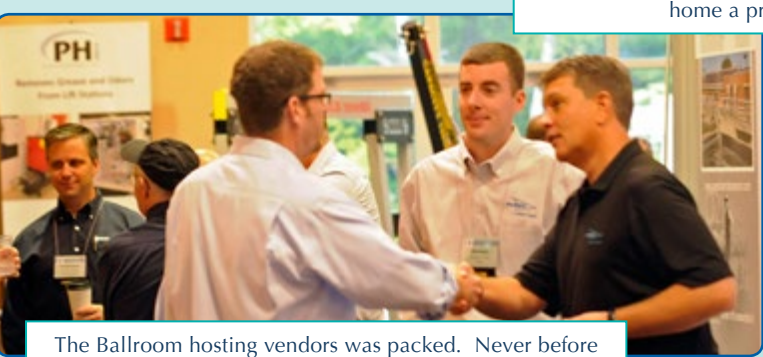
The Ballroom hosting vendors was packed. Never before have we had to bounce people from the Vendor area at the end of the night. Thanks to all vendors who had a booth!