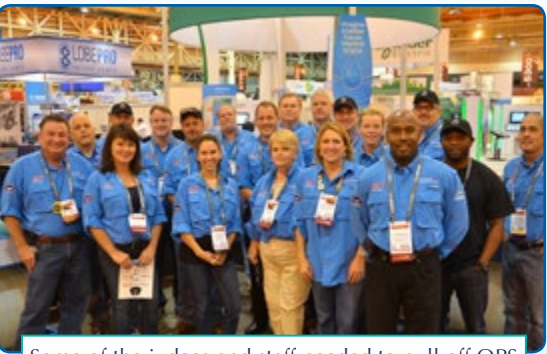
Some of the judges and staff needed to pull off OPS Challenge at WEFTECH

One of the best parts of the event was seeing all the creative team names, logos, jerseys, and hard hats as well as the unique way each team goes about their challenge. Some of the notable team names were the Brown Trout, Motley Poo, the Sewer Rats, and my favorite FORCE MAINE. Being from Maine, I was unable to be a judge for our own team, as is the rule for all judges.