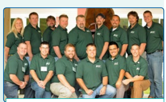
Graduates of the 2014 JETCC Management Candidate School. Congrats to you all, and kudos for wearing the same shirt that day. What a weird coincidence.