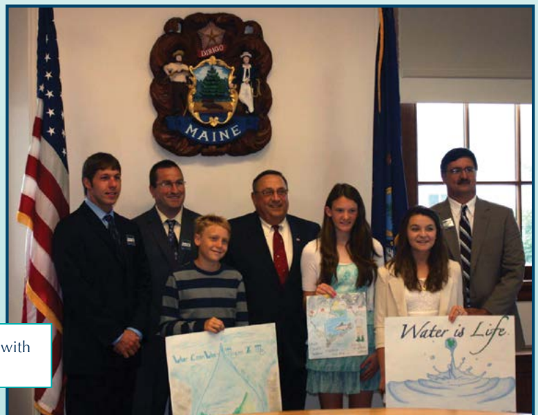
MWWCA Clean Water Week Poster Contest Winners with Governor Lepage and MWWCA members.