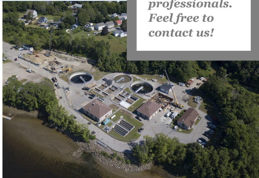
Photo Credit: Andrew Dickinson, Saco Water Resource Recovery Facility

Infrastructure funding is essential to Maine's clean water and drinking water facilities. There is $3.1 billion of clean water infrastructure needs in Maine. The State Revolving Fund (SRF) Program is critical to funding these projects that have positive economic impacts for Maine communities now and well into the future.