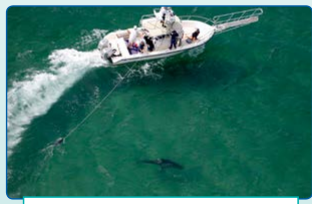
Tracking white sharks.

Maine Water Environment NEWS is a quarterly publication of the Maine Water Environment Association. (Publication months: Feb, May, Aug, Nov) Comments on the content in this publication should be addressed to: MEWEA, 60 Community Drive, Augusta, ME 04330.