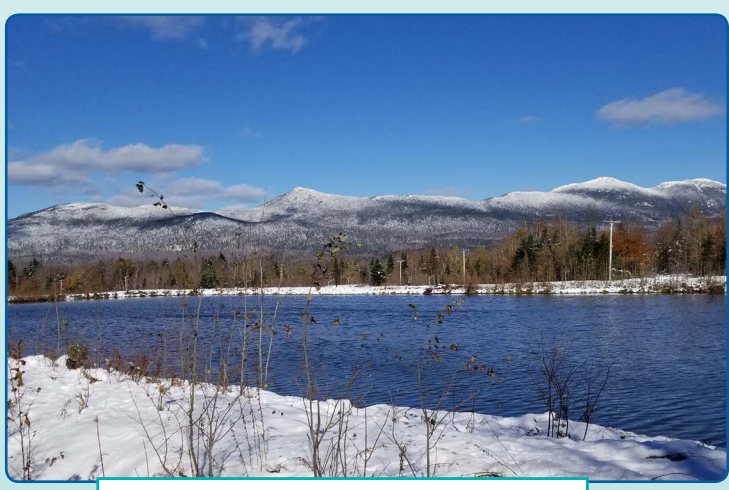
Wastewater treatment with a view.

Effluent disposal using spray irrigation currently occurs on about 20 of 40 woodland acres during the warm season as shown in