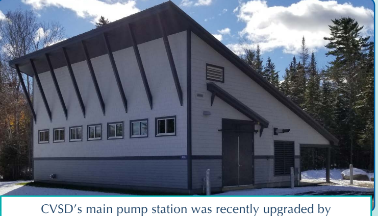
VSD's main pump station was recently upgraded by TBuck Construction and Olver Associates

Maine's own Carrabassett Valley WWTF was the world's first permanent Snowfluent plant. The Snowfluent™ treatment process was developed by Delta Engineering out of Ontario, Canada. Woodard and Curran worked with the District to successfully prove to Maine DEP the viability of the treatment process.